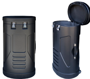
*Package includes hard case