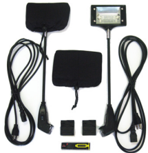
*Optional 200 watt halogen lights available for $69 each