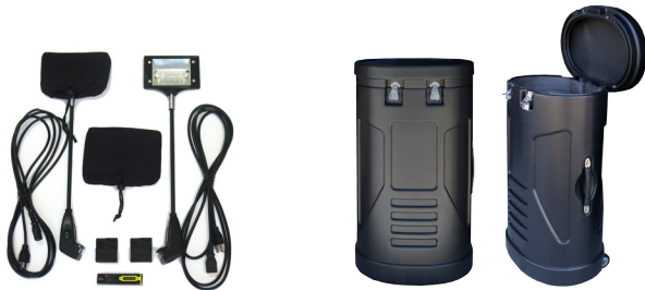
*Optional 200 watt halogen lights available for $69 each