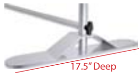
17.5" Deep Sturdy Steel "Bridge" Support Base.