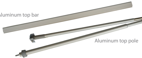
Aluminum top pole