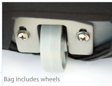
Bag includes wheels