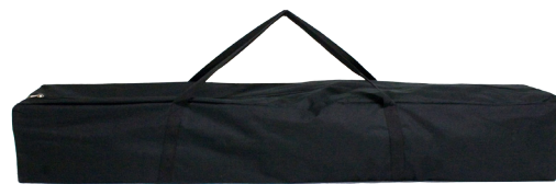
Nylon Travel Bag