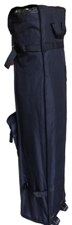
Travel Bag w/wheels (option)