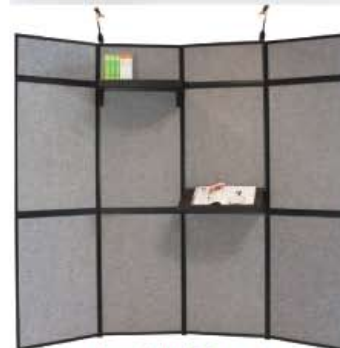
Spot light $39 each Shelf $39 each